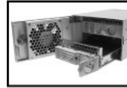
Fig.4a for CKDF

2. Use the miniature key and insert into the key hole to eject handle. (Fig.3)