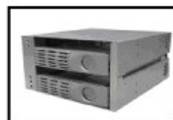
Fig.10b for CPF

9. Close the front door and insert the key into the lock hold to lock. Turning the key clockwise to complete HDD installation. (Fig.10a) (Fig.10b)